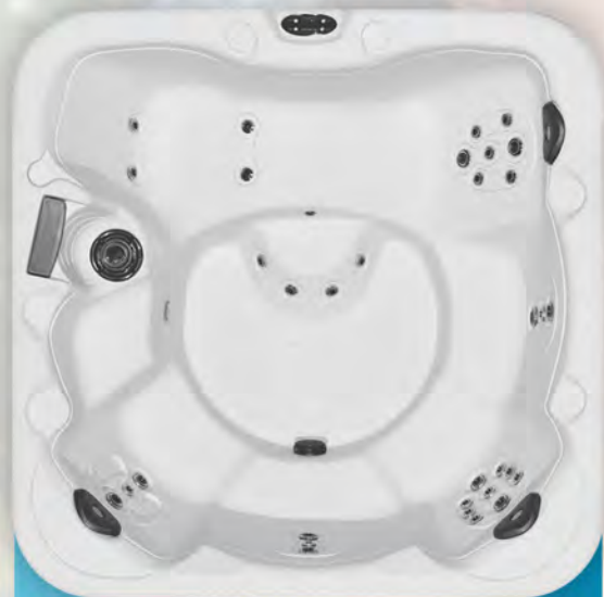
GETAWAY LODGE 6

The Getaway Lodge Series Hot Tubs are specifically designed to meet the needs of the holiday let market. They are affordable and durable for holiday properties. The spas do not need specialist electrical supply, plumbing, equipment, or installation. Creating a stand-out holiday let just got a lot easier.