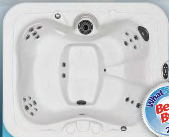
GETAWAY LODGE 4

Master Spas use foam insulation that does not contain any ozone-destroying gases or gas emission hazards. Full foam insulation maximises heat retention and temperature control, which results in lower energy costs. Every Getaway Lodge hot tub meets stringent energy efficiency regulations