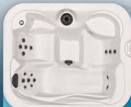
GETAWAY LODGE 2